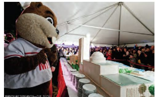
Tim the Beaver made an appearance to admire the cake.

The 1,000 pound birthday cake was 24 feet long, and featured campus landmarks such as the Great Dome, Simmons Hall, Kresge Auditorium, the Green Building, the Stata Center, the new MIT Sloan School as well as cars along Memorial Drive, Tim the Beaver crawling across the Massachusetts Avenue bridge and a Charles River of blue and white cupcakes spelling "MIT 150." Reminiscent of "night work hacks" using office lights in the Green Building to send messages, the windows of the Prudential Center were lit to read "MIT 150" providing the perfect backdrop for a spectacular fireworks display over the Charles River. In the spirit of the evening, Susan Hockfield pointed out that the 750 foot high "MIT 150" tribute on the Prudential Center was actually 134.32 Smoots high. A great story on the "Toast to Tech," including a video of the fireworks display is available at: http://web.mit.edu/newsoffice/2011/toast-to-tech-0606.html